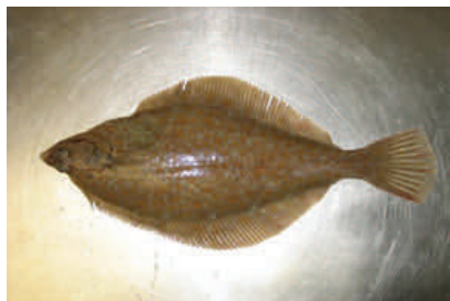
Yellowtail flounder (Limanda ferruginea).

Although various ideas and suggestions were offered at the meeting to initiate this process, the Council still must make timely decisions based on the best available science, and balance biological, social, and economic information and the competing perspectives of many stakeholders and interested parties.