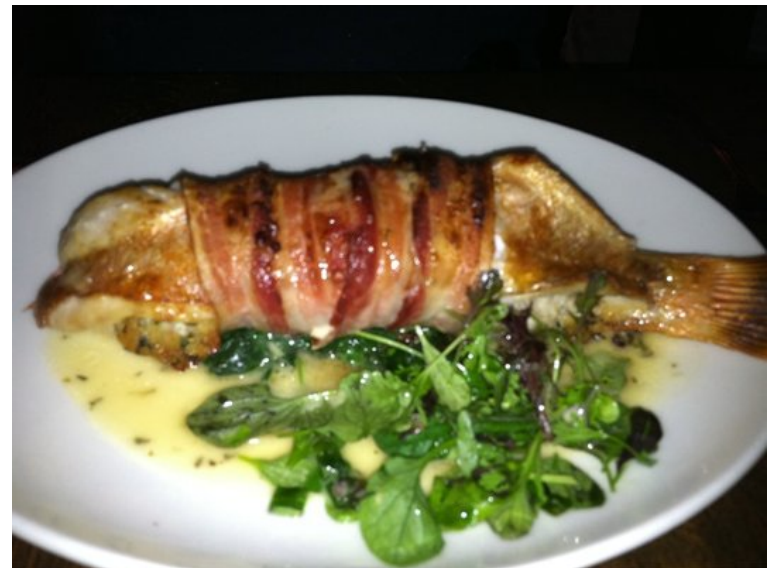
Mooring Restaurant, Newport RI