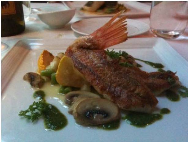
Burgamot – Cambridge, MA